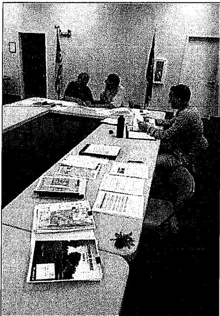
The Town of Burke Comprehensive Plan Steering Committee

The Smart Growth legislation also outlines specific procedures for public participation that must be