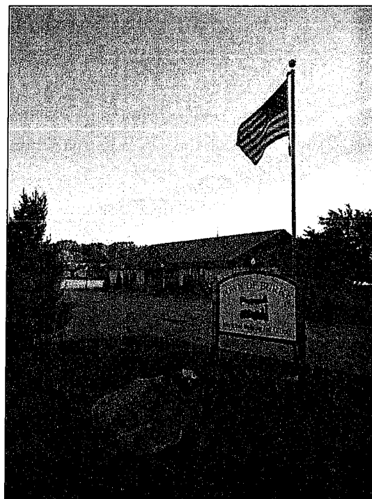
Town of Burke Town Hall.

The beautiful countryside of Burke is rich with productive farmland. Generations of Burke families have enjoyed the quiet rural character and strong sense of community found here. However, the Town's population has been increasing steadily, presenting both opportunities and challenges. Economic growth has provided local employment opportunities, urban amenities, and a larger, diversified tax base. However, as population increases, so does the need for services to keep pace with growth and changing demands. In addition, growth brings with it additional pressure on the existing resource base that is necessary to sustain and improve the quality of life for future residents. In this context, it is essential to plan for development in a controlled, orderly, and predictable manner that will enhance the Town's ability to retain its rural character, avoid land use conflicts, provide housing and appropriate employment opportunities, and protect its natural, cultural, and agricultural resources.